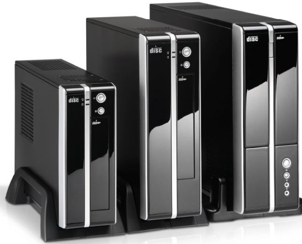
CI-9E8C CI-9E89 CM-9E8A